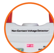
Red Light Indicates Detection of Non-Contact Voltage (NCV)