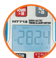
6000 Count Backlit LCD Display